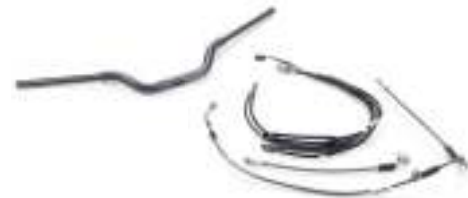
SPORTS HANDLEBARS A9638216 FITTING KIT - A9638202