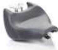
SPORTS RIDER SEAT A9700877