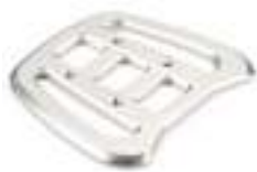
LUGGAGE RACK A9758313