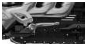
MID FOOT CONTROLS A9770218