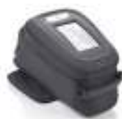
MAGNETIC TANK BAG A9518171