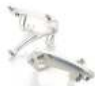
PANNIER MOUNTING KIT A9518172