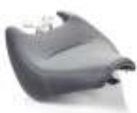
TOURING RIDER SEAT A9700876