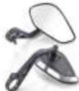
BAR END MIRRORS - SPORTS A9630721