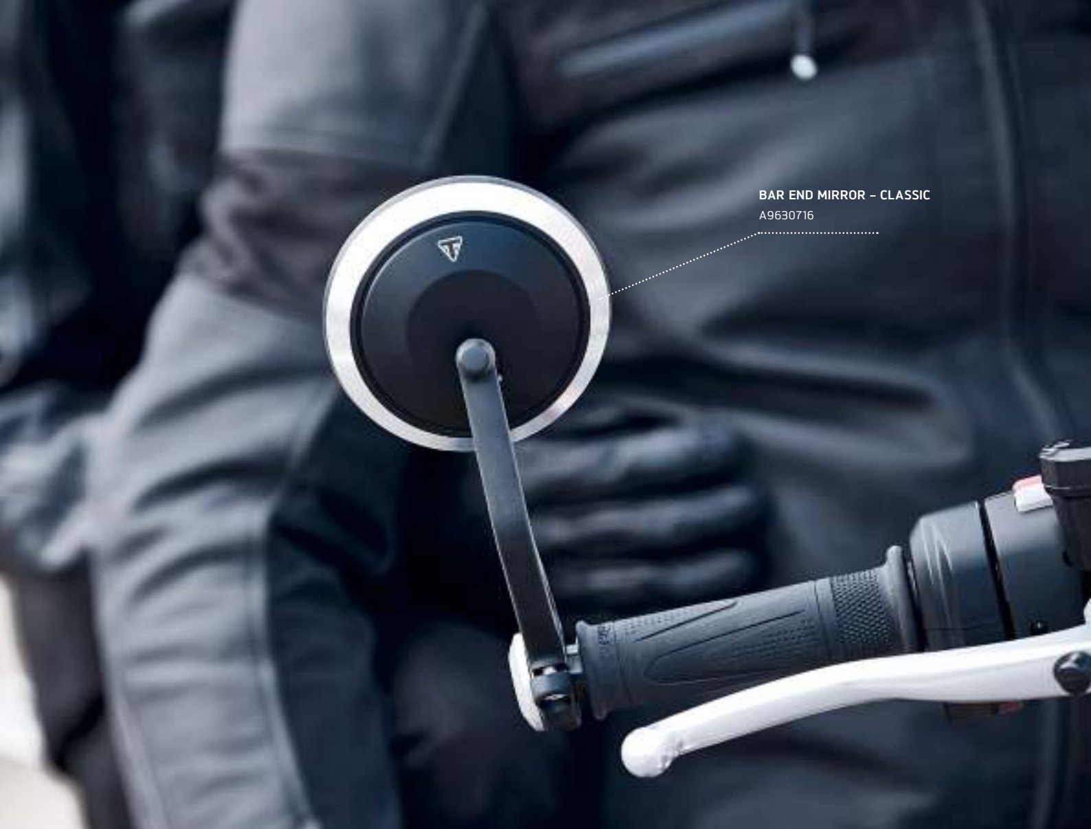
BAR END MIRROR - CLASSIC A9630716