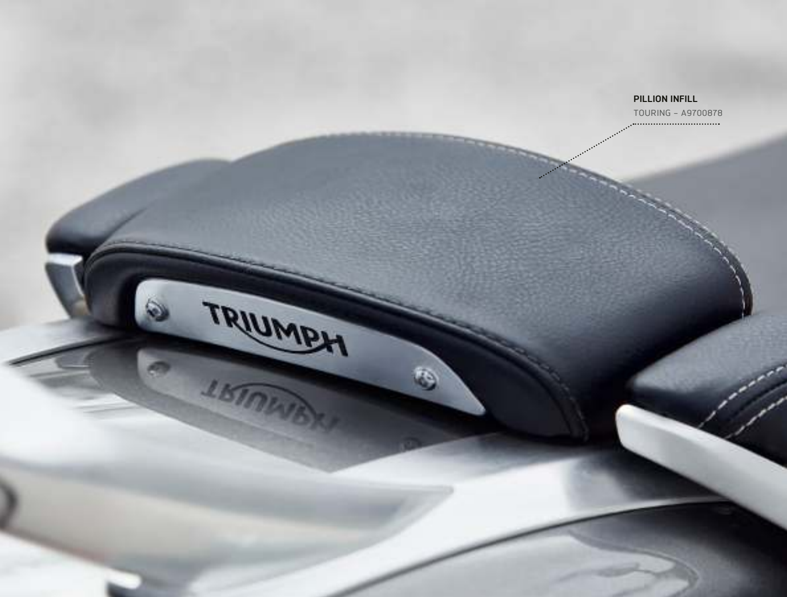
PILLION INFILL TOURING - A9700878