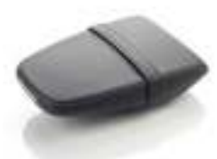
PILLION SEAT COMFORT - A2307859 TOUR - A9700904 SPORTS - A9700903