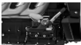
FORWARD FOOT CONTROLS A9770217