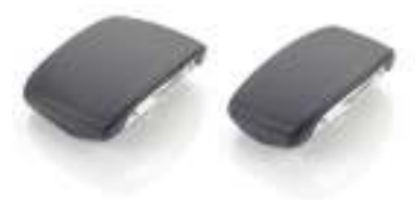
PILLION INFILL TOURING - A9700878 SPORTS - A9700879