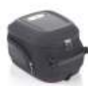
SPORTS TAIL PACK A9510469