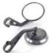
BAR END MIRROR - CLASSIC A9630716