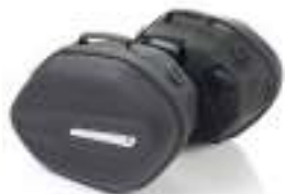
QUICK RELEASE SPORTS PANNIERS A9510535