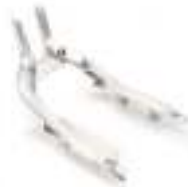
ADJUSTABLE BACKREST A9758316